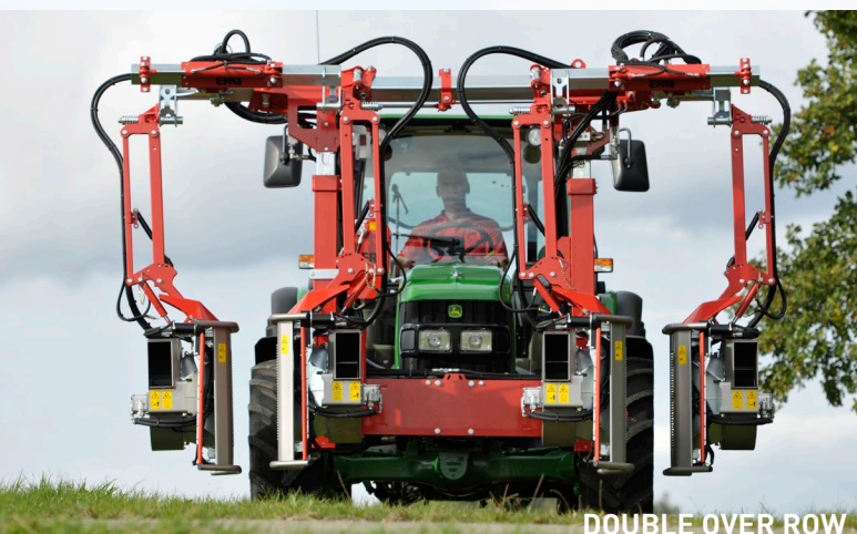
DOUBLE OVER ROW