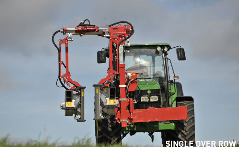
SINGLE OVER ROW