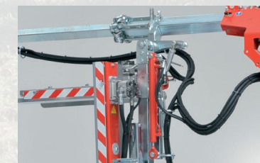
HYD. ADJUST HORIZONTAL CUTTER BOARD (400MM)