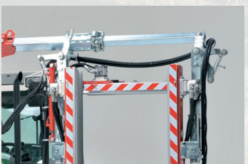
HYD. CUTTING WIDTH ADJUST