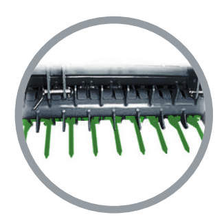
PICK UP FEEDER WITH RAKES