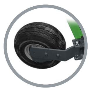
BACK WHEELS WITH REINFORCED SUPPORT