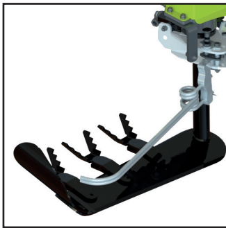
SMALL WEEDS SHOVEL/S FOR BLADES

Important note: both hydraulic pipes always have to go connected one to pressure and other one to return without pressure (to tank).